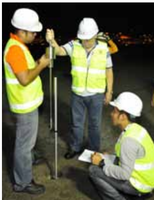
In-situ California Bearing Ratio (CBR) Test