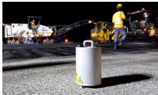
Testing of Pavement Surface Macrotexture