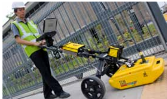
Ground Penetrating Radar (GPR) Test to determine thickness of underlying pavement layers