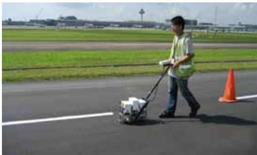
Profile Data Collection and Ride Quality Assessment