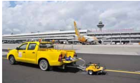
Skid Resistance Testing