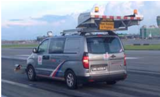
Automated Distress Imaging & Rating