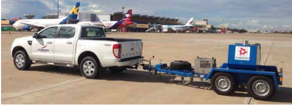
Pavement Structural Assessment