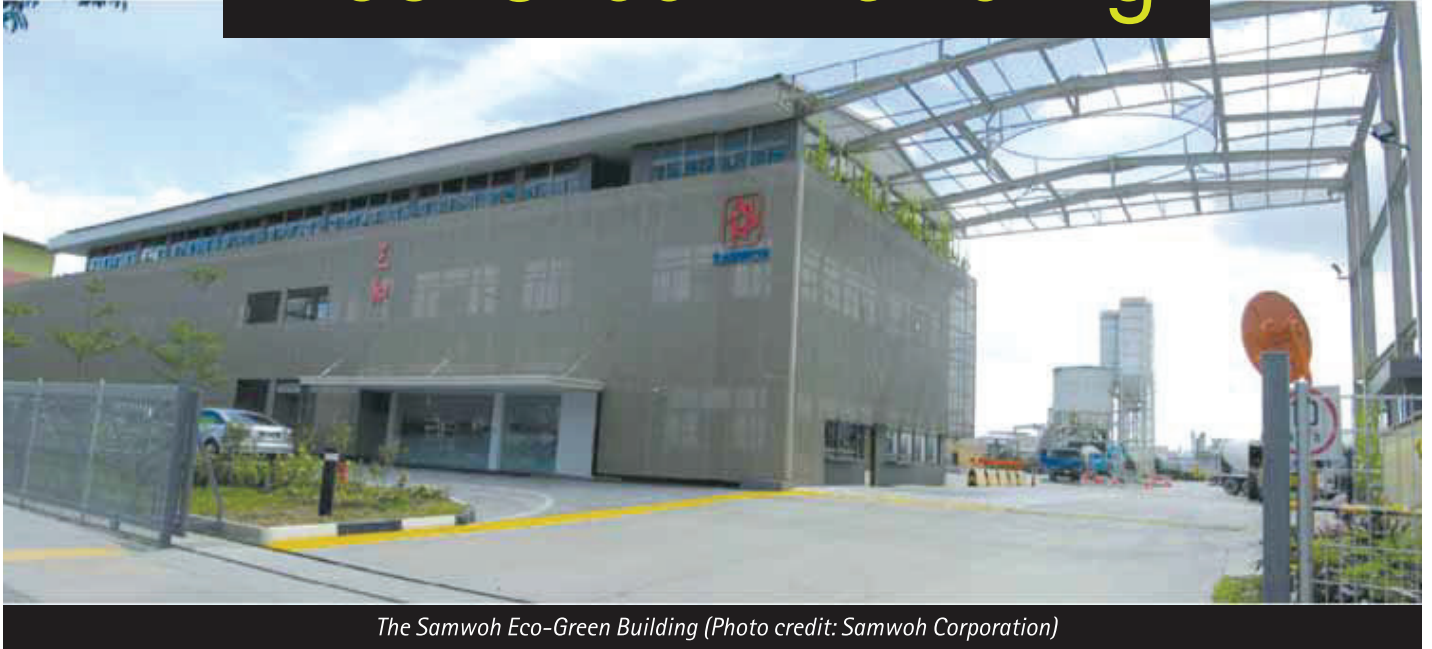
The Samwoh Eco-Green Building

When it was unveiled on 22 March, the Samwoh Eco-Green Building was the first building in Singapore – and possibly one of the first few in the world – to use concrete made with 100% recycled concrete aggregates for the top level.