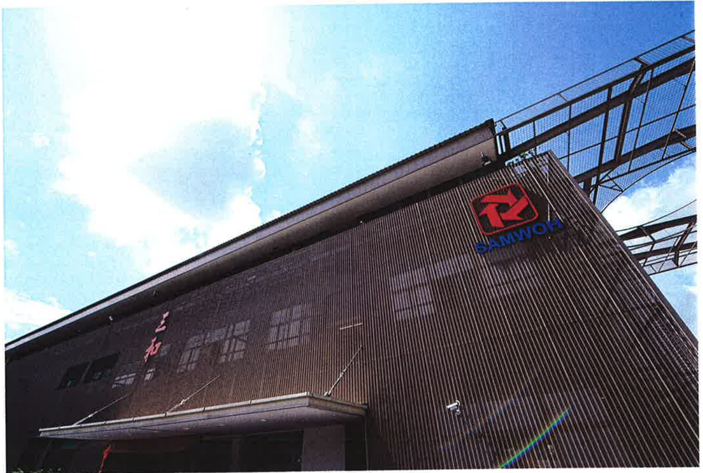
SAMWOH CORPORATION'S ECO-BUILDING IS THE FIRST PROPERTY IN SOUTHEAST ASIA TO BOAST AN ENTIRE LEVEL BUILT WITH CONCRETE CONTAINING 100 PER CENT RECYCLED AGGREGATE (LOOSE GRANITE). THE BUILDING LOCATED IN THE INDUSTRIAL ESTATE OF KRANJI CRESCENT IS COVERED IN A STEEL MESH TO PROTECT IT FROM THE SUN AND DUST.

Many companies in Singapore are pumping resources into emerging newer and cleaner technologies, and this is helping their bottom line as well as the environment. BiZQ takes stock of this development.