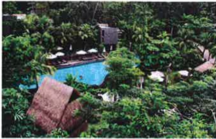
AN AERIAL VIEW OF THE SILOSO BEACH RESORT IN SENTOSA.

stage, the property was built with the environment in mind.