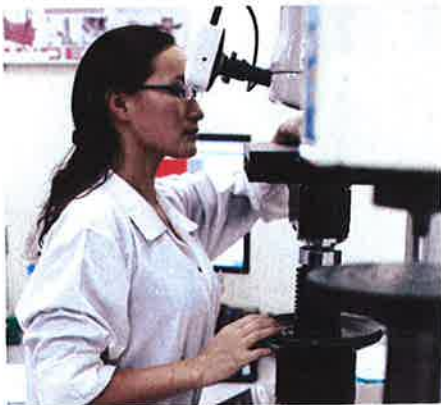
EXOVA SINGAPORE DEVELOPED NEW METHODS IN CALIBRATION, CERTIFICATION AND TESTING TO MEET MARKET DEMAND FOR MATERIALS TESTING SERVICES.