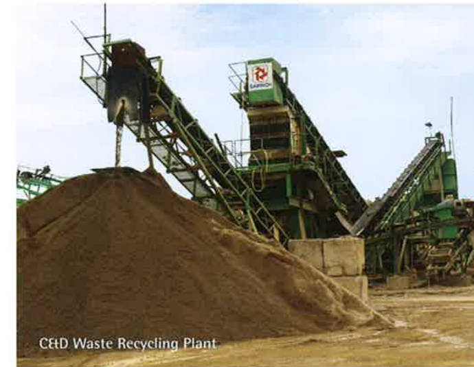
C&D Waste Recycling Plant

Centre, is the first building structure in the region using concrete with up to 100% RCA to replace the natural aggregate. It has attained the