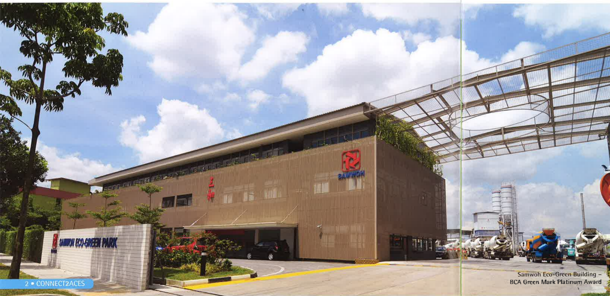
Samwoh Eco-Green Building – BCA Green Mark Platinum Award

The accomplishment of Samwoh Eco-Green Building has opened a new chapter in sustainable development in Singapore. The Eco-Green building showcases a breakthrough in construction technology by using concrete with up to 100% RCA which is beyond the existing design code limits. The data obtained from the project are useful for the updating of existing building code requirements to allow the use of RCA in all buildings in the future. As such, we are able to take a massive step forward to achieve the nation's goal of sustainable development.