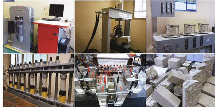
Extensive R&D works have been carried out before the construction of Eco-Green Building

Samwoh Corporation, a leading integrated construction company and green products supplier, has embarked on an ambitious and