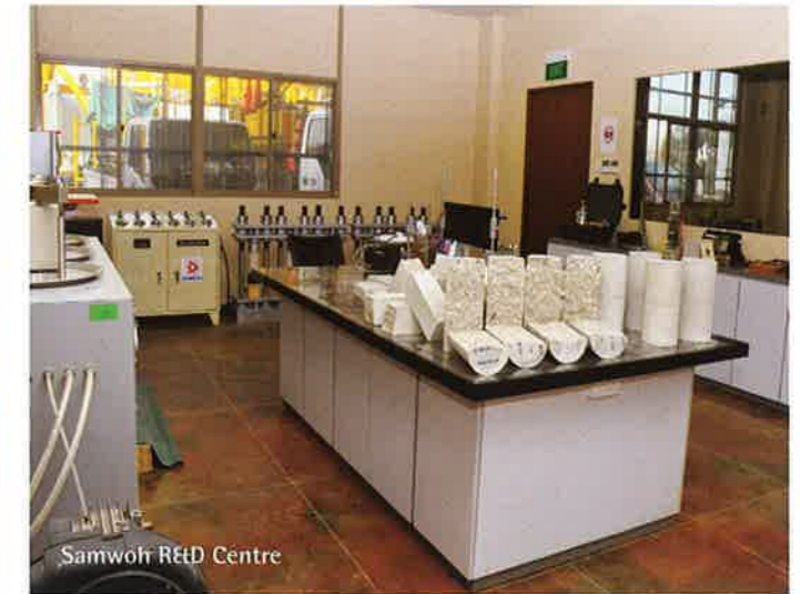
Samwoh R&D Centre

highest level in the BCA Green Mark certification – the Platinum Award, in 2010.