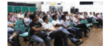
Full attention given during the session by the speakers.