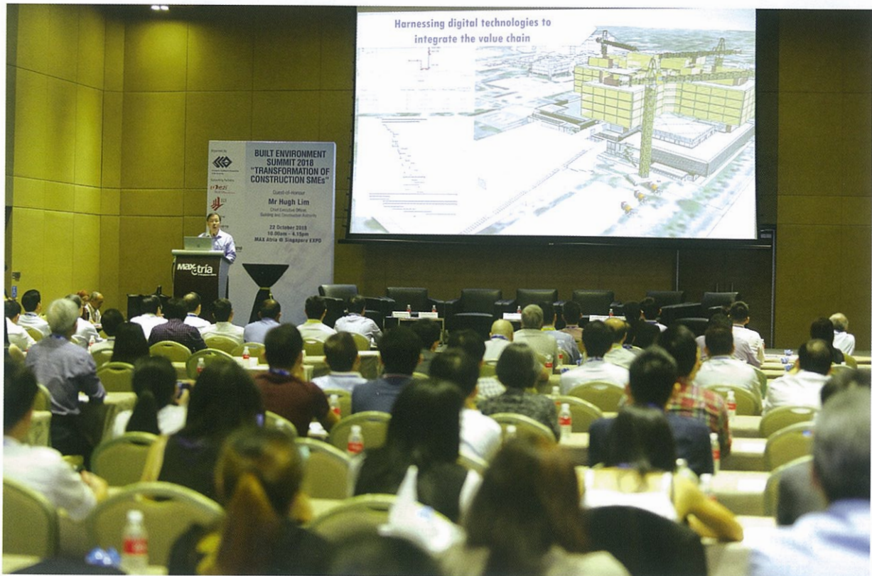
Over 150 industry professionals attended the SCAL Built Environment Summit 2018.